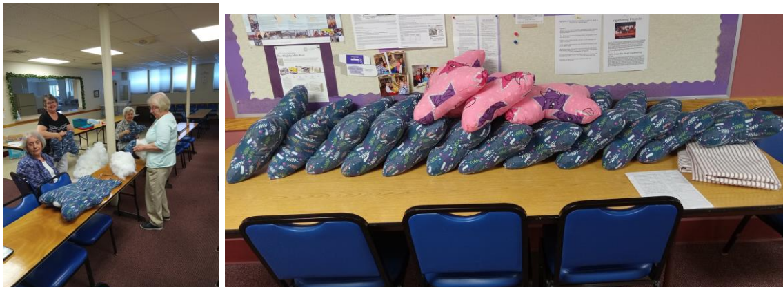
Scenes from the Ladies Aid Tea on September 8, 2022

Ladies Aid of Immanuel Lutheran Church, Everett WA made butterfly pillows for Providence Hospice.